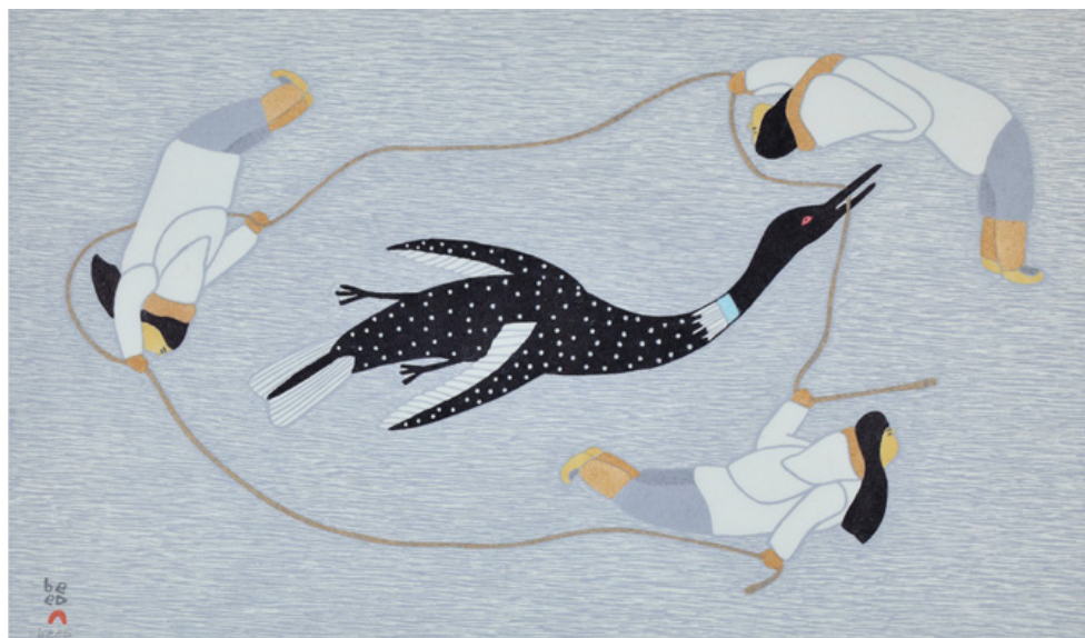
Gavavau Manumie, Chasing the Loon , 2015, stonecut and stencil, 15" x 24".