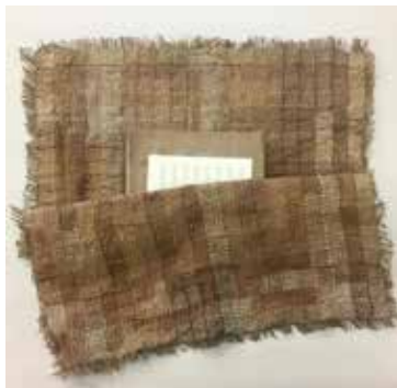
Camille Belair, process shot of hand-bound book with reinforced burlap, jute and cotton cover, limo-cut printed kraft and manila paper, with music notation paper interior.

The idea of iteration is indicative of process becoming practice. It is documenting, collecting, compiling. Watching the seed root and grow. Doing the thing, again, doing it differently, learning from it and yourself. Iteration is confrontation, contemplation, and embodiment. This exhibition encourages slow, playful, and deep looking within and outside of the grid to see the patterns of iteration, and the methods employed by each artist towards visual synergy.