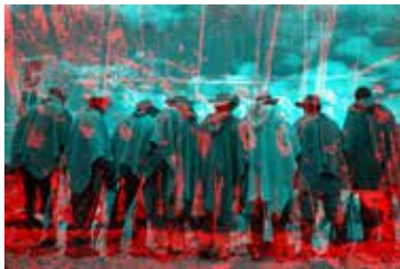
Fredy Forero, Benidorm y Sitges, 2017, from the series, Seguridad Nacional, 250 cm x 376.57 cm, Installation (detail)

Curated by Analays Álvarez Hernández and Colette Laliberté