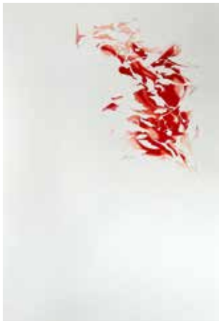
Bepa (Belief), pencil and watercolour on paper, 30" x 44", 2022

Organized by the OCAD U Ukrainian Student and Alumnus Collective (USAC), this juried exhibition and auction showcases current students, alumni, and faculty. Presented in partnership with the Canada-Ukraine Foundation, this event aims to showcase and celebrate the resilience and eclecticism of Ukrainian art and design.