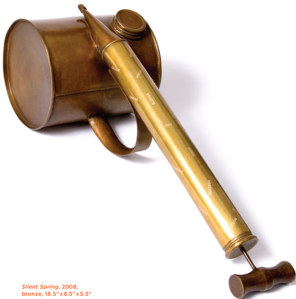
Silent Spring , 2008, bronze, 18.5" x 6.5" x 5.5"