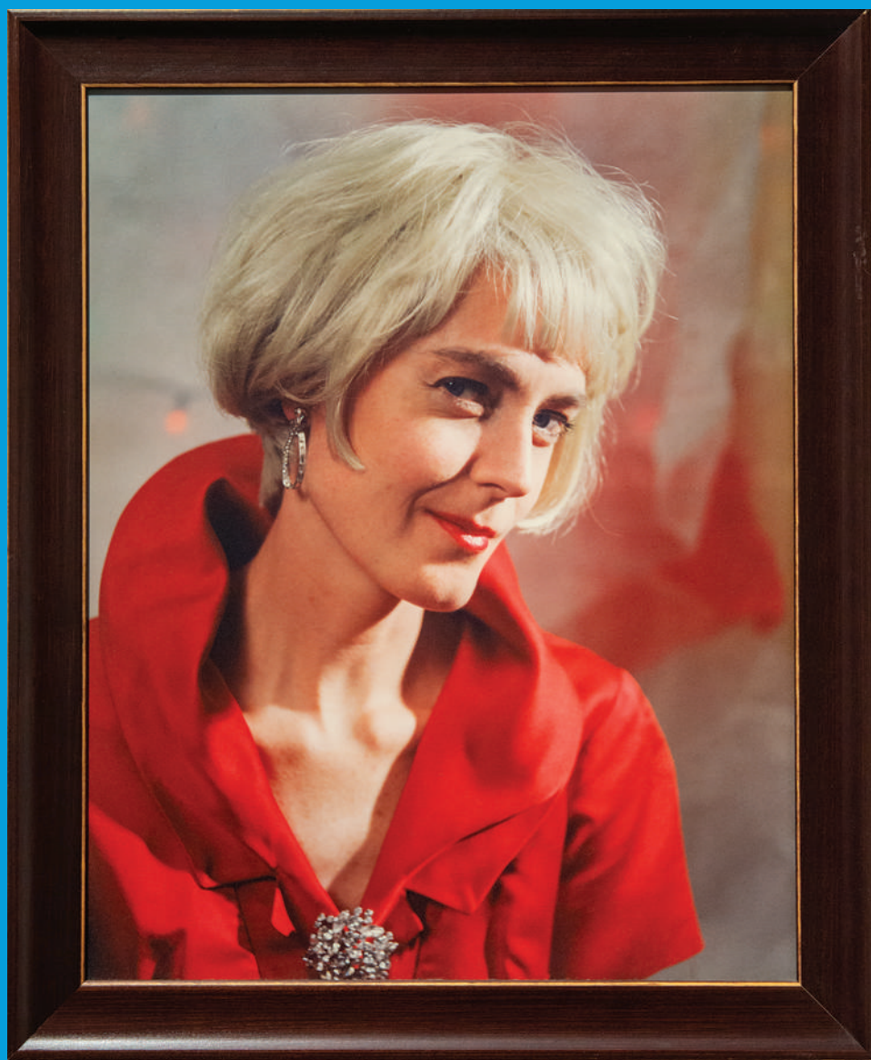
Untitled, undated, photograph, 19.5" x 15.5".