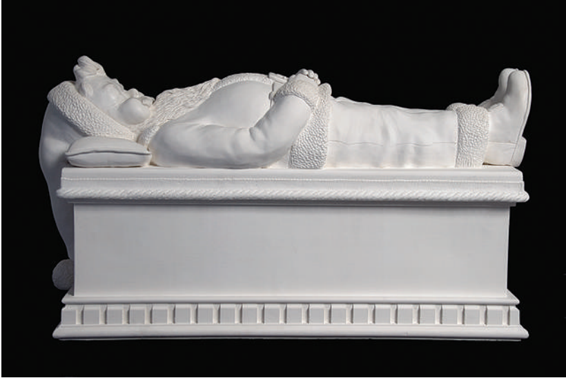
The End , 2007, plaster, 13.5" x 25.5" x 8"-.