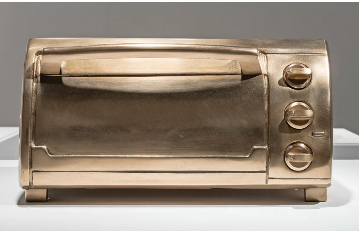
Top to bottom: Leda and the Beaver , 2000, plastic, 2.5" x 11.75" x 5.5". Promised gift from the Estate of Wendy Coburn to the Hart House Collection. Courtesy of the Art Museum at the University of Toronto; The Alchemist , 2013, bronze, 8" x 15.75" x 9".