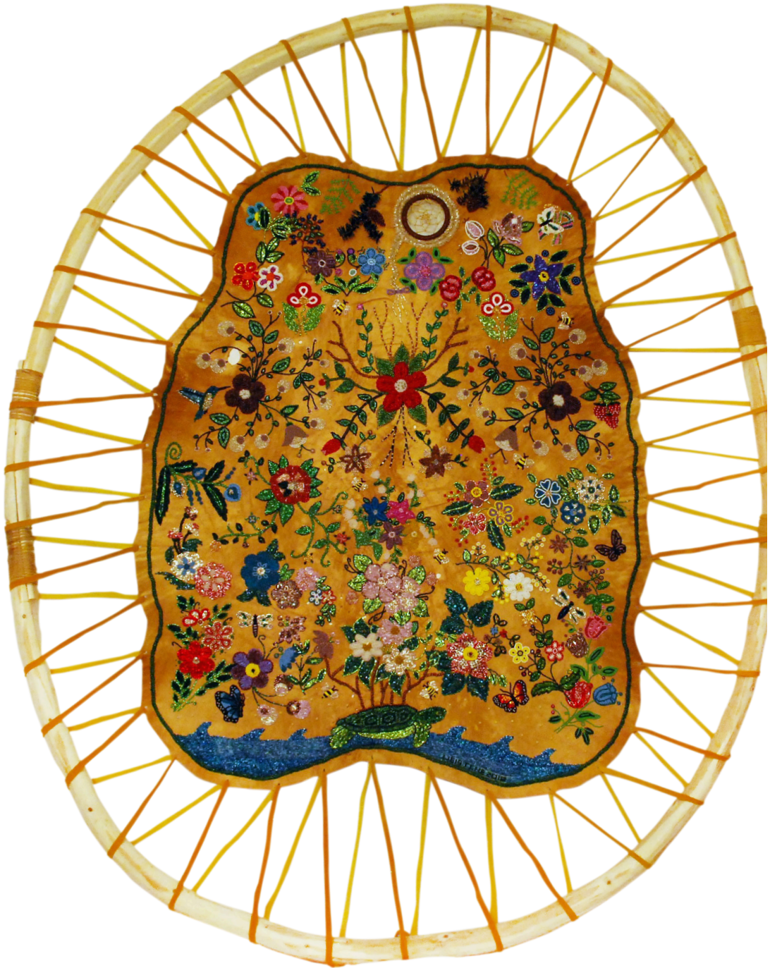
Flora Weistche, My Grandmother's Garden – Nuuhkim Unihtaauhichhikan , 2018, hide of the artist's father's last hunted Caribou, glass beads, thread, wood, 62.75" x 50.75" x 2" unframed. Courtesy of the artist. Photo by Tristan Beauregard.