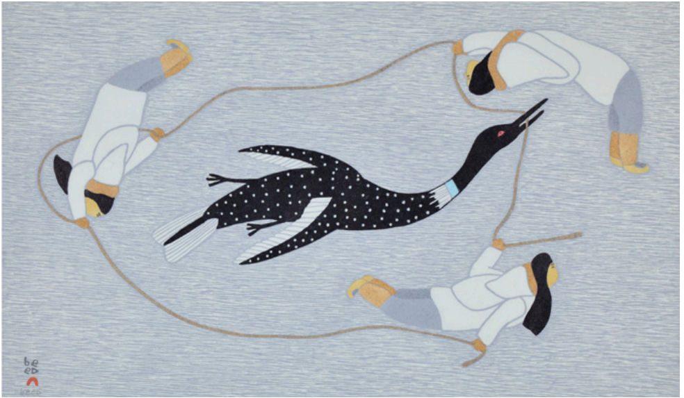
Qavavau Manumie, Chasing the Loon , 2015, stonecut and stencil, 15" x 24".