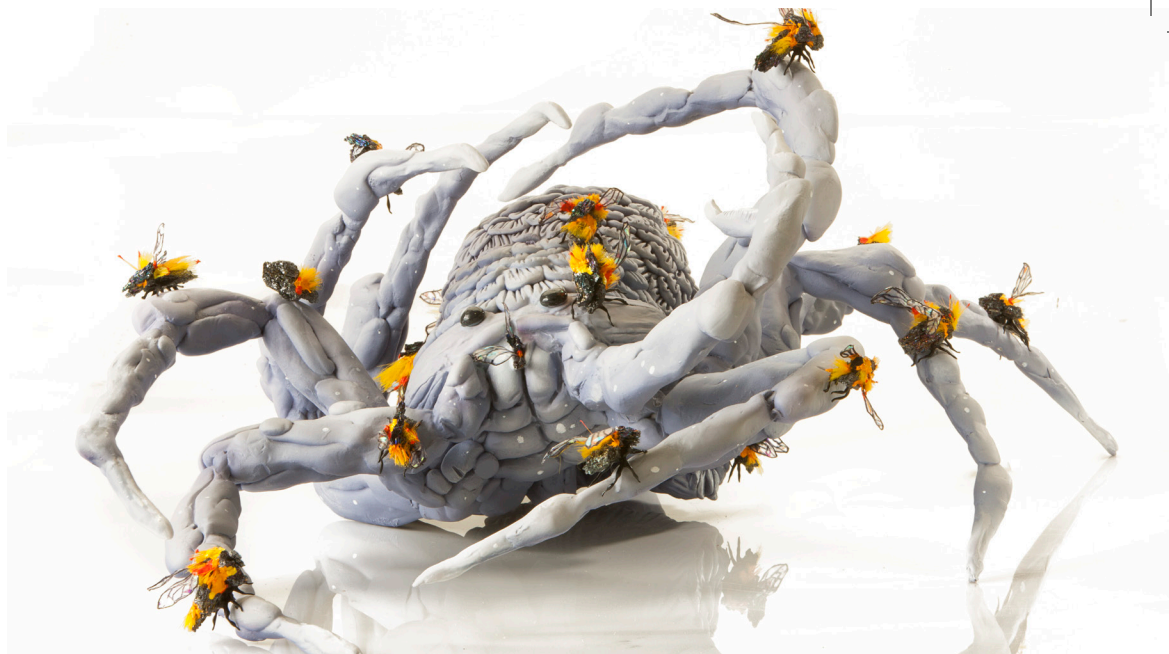
DaveandJenn; No Horizons ; 2017; polymer clay, acrylic paint, silicon carbide, fibre, wire, acetate and dichoric film; 8.5" x 11.25" x 19.75".