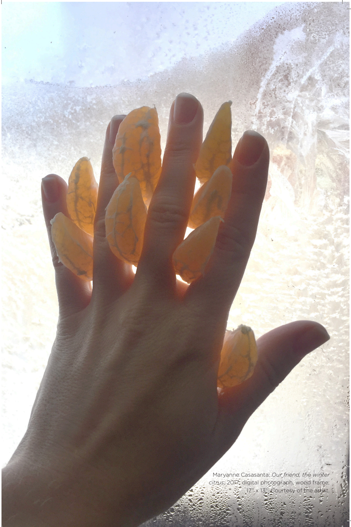
Maryanne Casasanta: Our friend, the winter citrus ; 2017, digital photograph, wood frame; 17" x 13"; Courtesy of the artist.