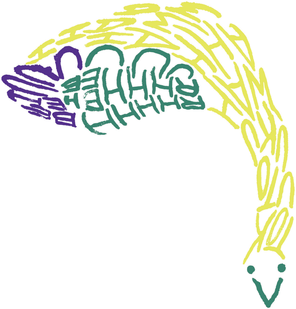
Naufus Ramírez-Figueroa, Concrete Poem Documentation of Bird Séances , 2011 to present, series of five digital prints on Epson coldpress watercolour paper, calligraphy by Lester Mead, 20" x 29.5".