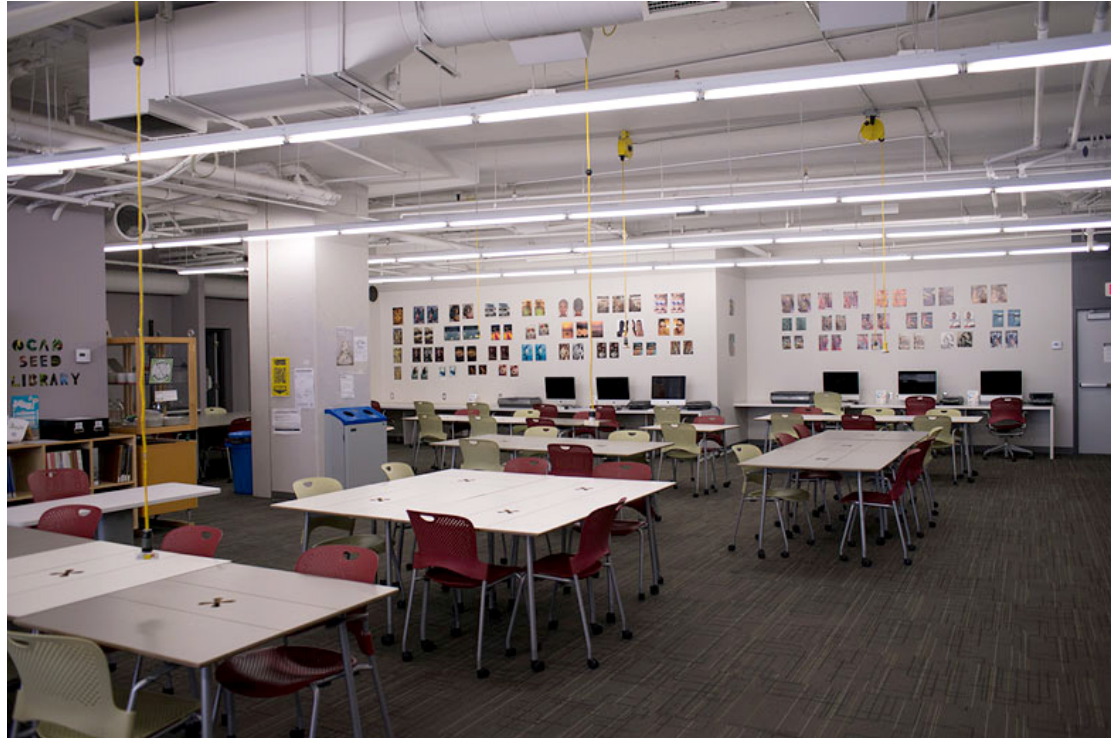
Learning Zone.

The Learning Zone is a studio-based library space; an alternative work area where you can collaborate with other students and faculty or seek assistance from Library staff. The Learning Zone Galleries feature unique and dynamic exhibition spaces with several venues for exhibition in a variety of media, including the Main Space, Xspace External Space and the Public Media Display.