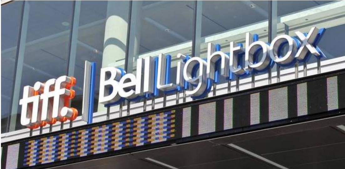
Tiff Bell Lightbox